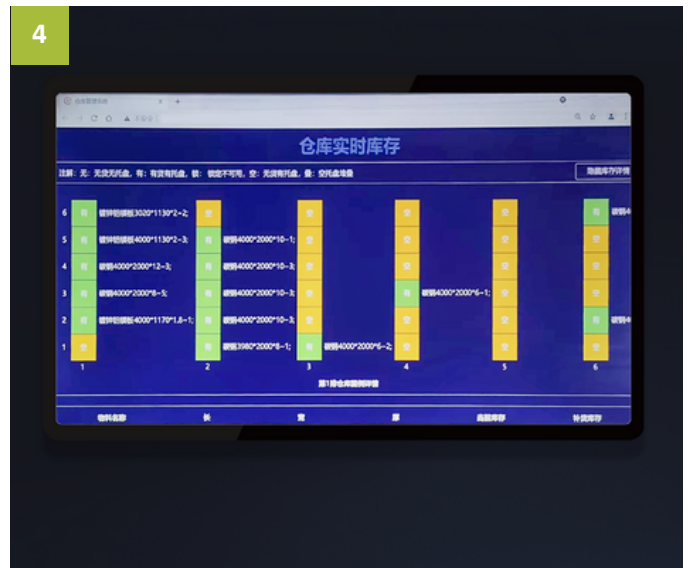
No manual lifting and guarding required