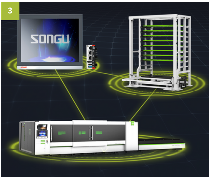
BECKHOFF Motion control systems