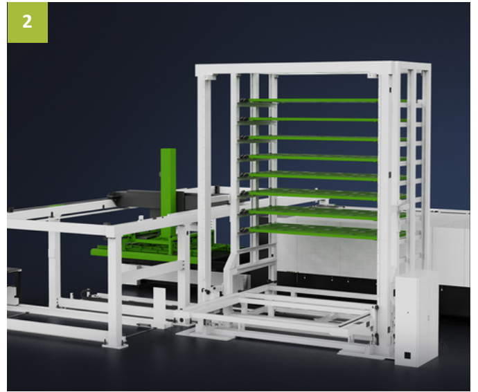
Customizable multi-layer storage